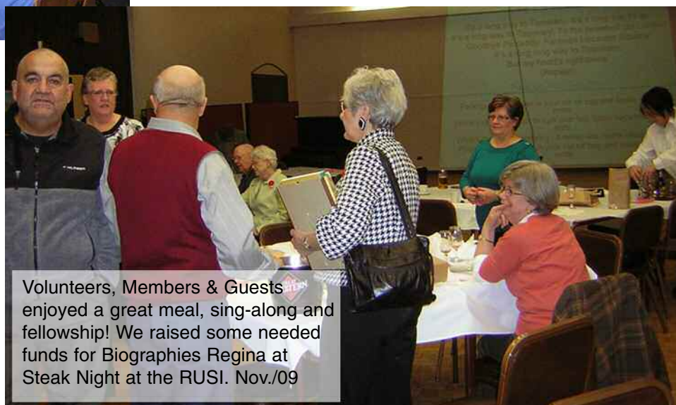
Volunteers, Members & Guests enjoyed a great meal, sing-along and fellowship! We raised some needed funds for Biographies Regina at Steak Night at the RUSI. Nov./09

What's next? – Perhaps a picnic in the park? An evening under the stars? Submarine races at the lake? Let us know your ideas and we will put something together for the enjoyment of your company.